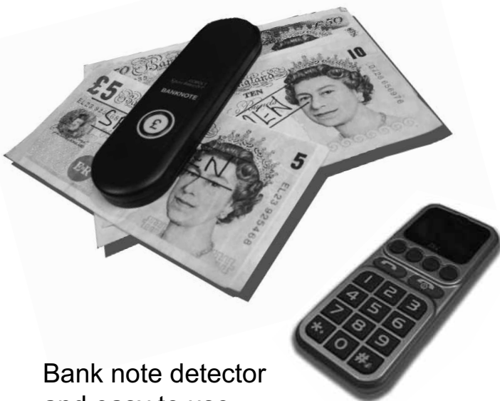
Bank note detector and easy to use mobile phone

Action has three Mobile vehicles which travel to locations around the UK with the latest aids, equipment, information and advice. Visitors to the Mobile are greeted with a warm welcome from our fully trained team who provide useful information about the latest products available, where they can try for themselves the latest technology and gadgets to improve daily life.